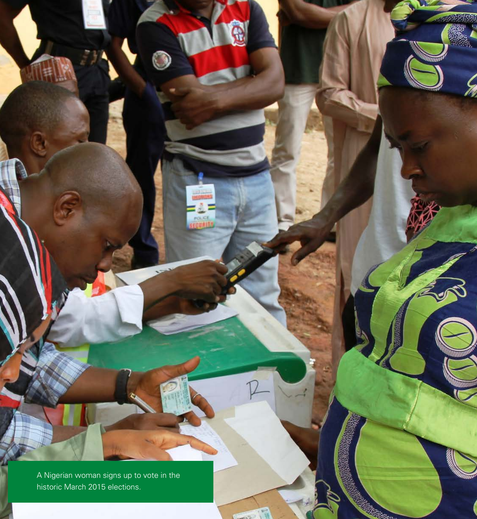
A Nigerian woman signs up to vote in the historic March 2015 elections.